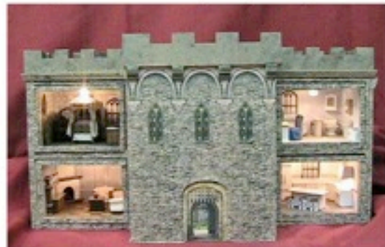
S3 The Tischu Castle 1/4" Luci Hanson