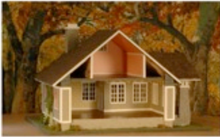
F3 Thatched Cobblestone 1/4" Karen Cary