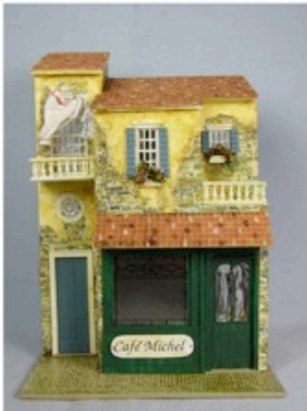
S1 Cafe Michel 1/4" Sue Herber