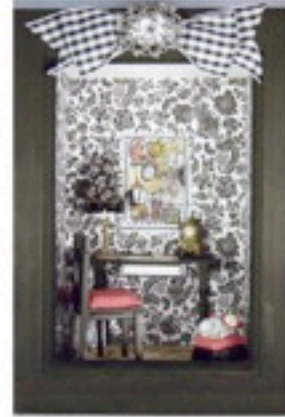
F2 Tribute to Toile 1" Sue Herber