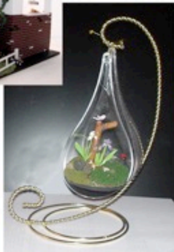
F5 Wire Flowers and Butterfly in a Dome 1" LadyBug Sue Thwait